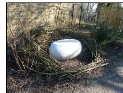
Nest Sculpture, Hall Place, 2013