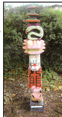
Vietnamese Totem Pole, Hall Place, 2001

Centrepieces holds regular Art Exhibitions and Art Auctions in venues such as local libraries, as well as an Annual Art Exhibition in the Stables Gallery at Hall Place.