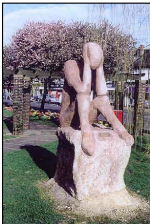
'The Worrier' Centrepieces, 2000, Public Sculpture

Centrepieces is a Charitable Incorporated Organisation (CIO), Registration No 1160300.