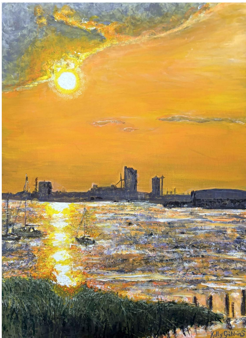
'Sunset Glow on River Thames at Erith'