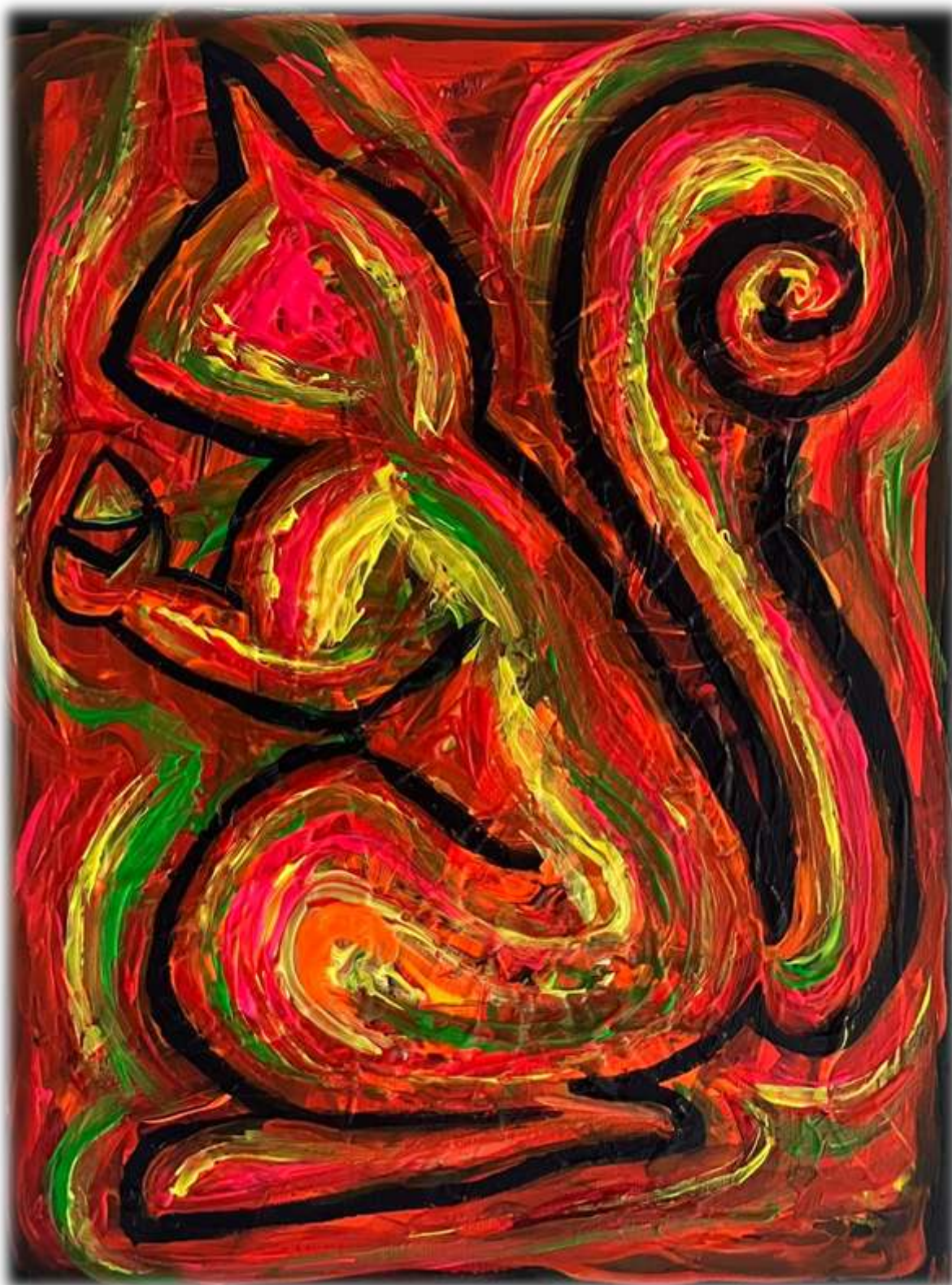
ABOVE: "Red Squirrel with Nut" – Nicola Wills.